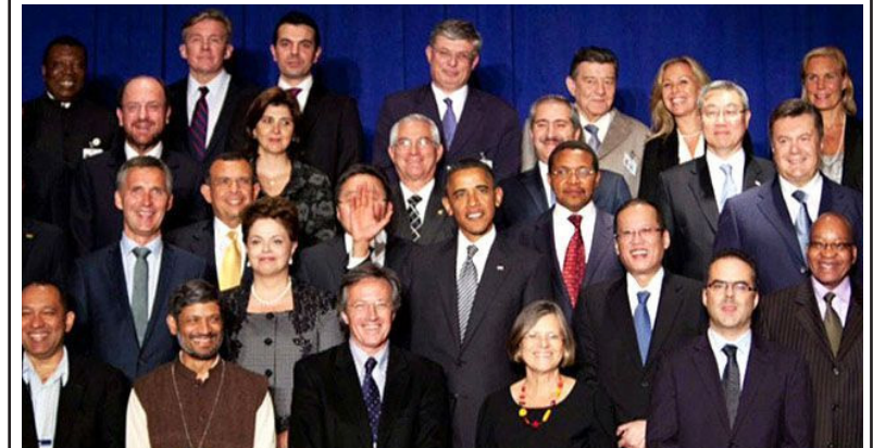
Like President Bush, Obama seems to like putting his hands into international affairs.

The president of Mongolia was asked of his opinion on the matter. "Ehh... He'll be out in a year anyway. Who cares?"